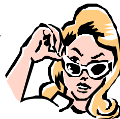
Ve-r-r-r-y interesting .....