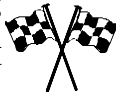
List your "For Sale" articles here