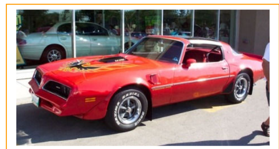
The owner of this Club Member's car has another collector vehicle. What is it?