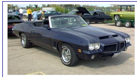
The owner of this Club Member's car is a Pontiac Trivia King. Who is his wife?