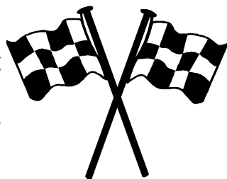
List your "For Sale" articles here

Bucket seat(s) from 70-72 Lemans/GTO..... Andre 256-7352 (H), 632-5598 (W) andre_lemoine@mts.net